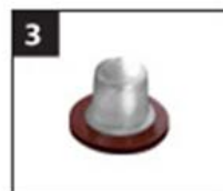
3 EAPT Embedded Automotive Post Terminal