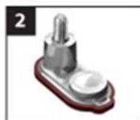
2 EHPT Embedded High Profile Terminal