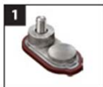
1 ELPT Embedded Low Profile Terminal