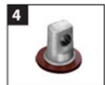
4 EUT Embedded Universal Terminal