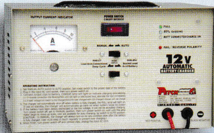
Models : TT06004DC-TT1210DC