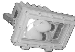
AFE1 250 250-400 W. for Mercury Lamp